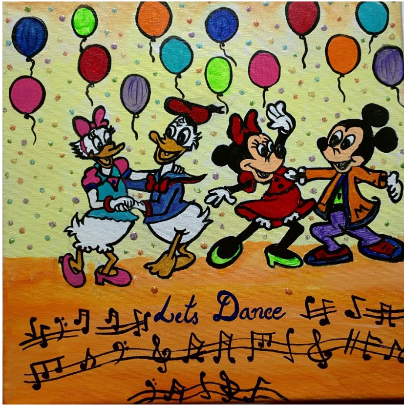
Contribution: Somali Sarkar